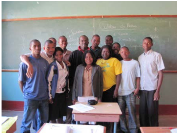
The First Year Seminary Students in Cambine together with their agric and English Teacher (Second row in a black jersey)

Students also take course in Agriculture. It is a combined course on theory and practical. The church does not expect to hear that a pastor dies of hunger while God gave us a fertile land and hands to work the land.