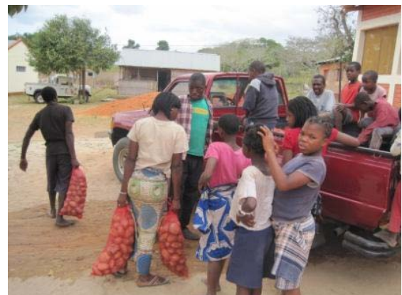
Orphans carrying bags of potatoes

Since seeds cannot be saved for the next production season, the seeds will be purchased to ensure project continuity